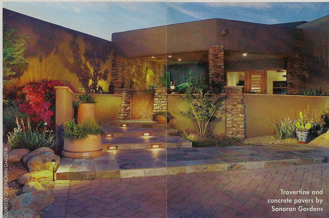
Travertine and concrete pavers by Sonoran Gardens

Costs per square foot, installed: Pouring color concrete averages $4.50. For scoring, add at least 50 cents. Water-based or acid staining adds around $2.50–4. Stamped concrete averages $8.50–10. Exposed aggregate concrete starts around $4.50. ▶